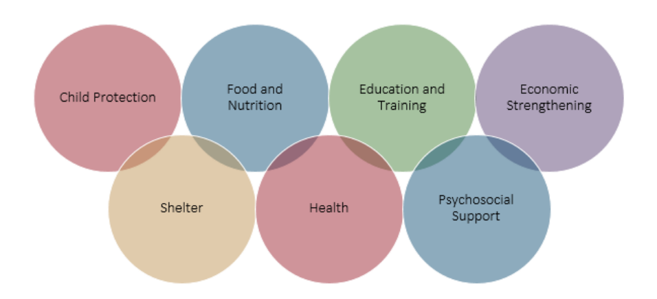
Figure 1: Recommendations to Prevent the Rise of Street Children Phenomenon