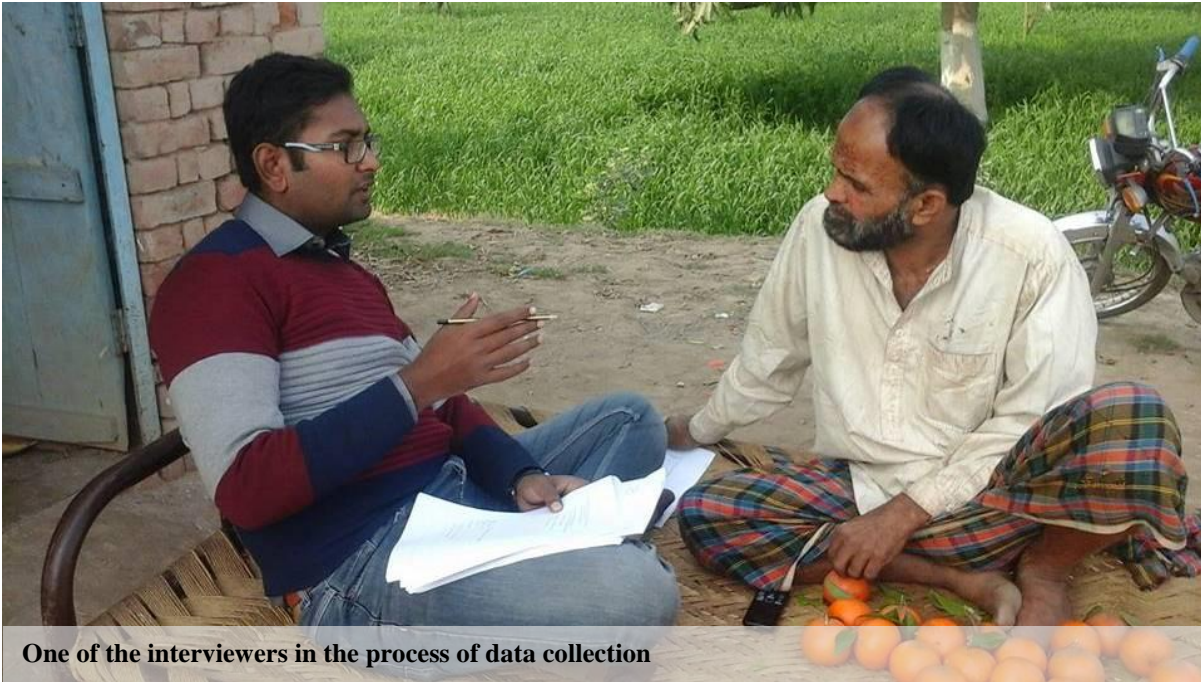
One of the interviewers in the process of data collection