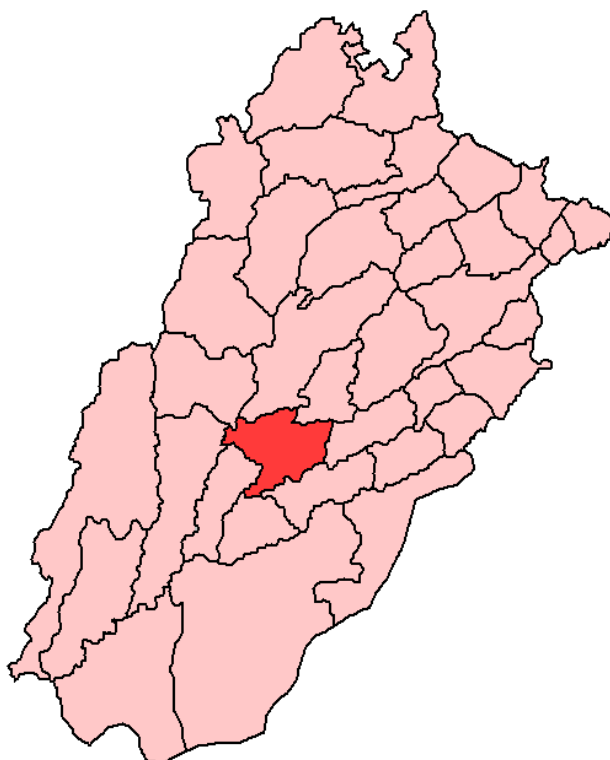
Project Area in the Map of Punjab - Pakistan