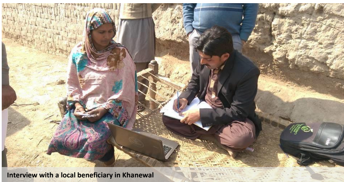
Interview with a local beneficiary in Khanewal

The field survey data clearly reveals that half of the total beneficiaries did not possess any land of their own, which is a measure of poverty. Even those households owning smallholdings are unable to rise above the poverty line. As a result, these families are poverty-stricken and unable to let loose themselves from a vicious circle of deprivation. Remarkably, a large portion of farmers with their own land produce grass for livestock alongside some other crops such as rice, wheat and cotton. It means that the households which own small land go for grass production to ensure feedings for their domestic animals.