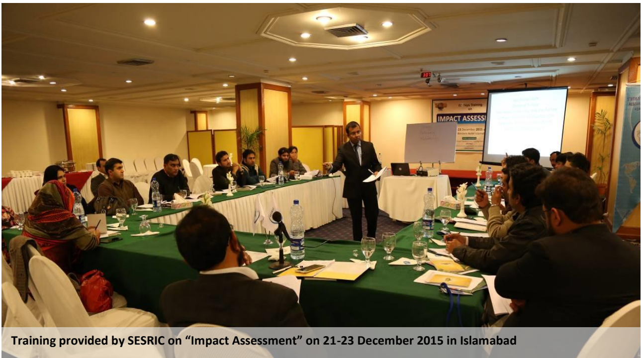
Training provided by SESRIC on “Impact Assessment” on 21-23 December 2015 in Islamabad