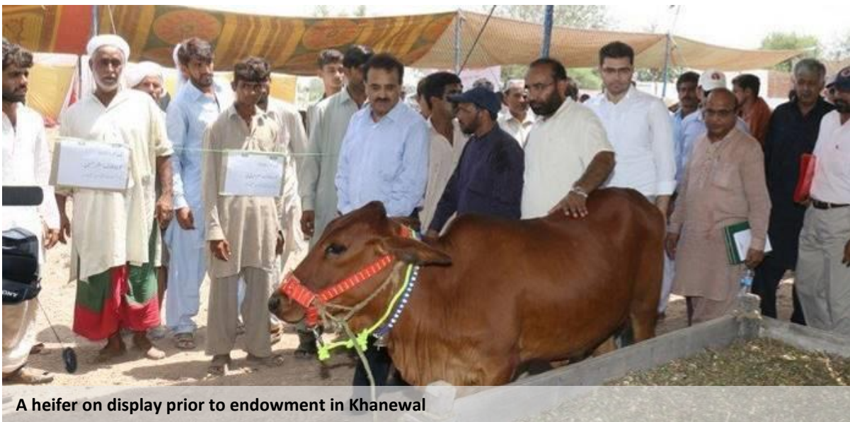
A heifer on display prior to endowment in Khanewal

Poverty alleviation is a key priority for Pakistan, where 45.6 percent of population is living under multidimensional poverty. In the area of human development, Pakistan ranks at 147 among 187 countries considered (United Nations Development Programme, 2016). Agriculture is the mainstay of the economy of Pakistan, accounting for 19.82 percent of GDP and 42.3 percent of total employment. The livestock subsector comprises 58.55 percent of the agriculture sector and its positive growth establishes its importance for poverty alleviation in Pakistan, where stockbreeding is considered to be a net source of invariable income for rural and middle income groups. Livestock industry generates 30 to 40 percent of income for about 30 to 35 million marginalized families, while also providing 10 to 25 percent of income to small and landless farmers as well (Pakistan Ministry of Finance, 2016). Additionally, the demand for meat and milk has been increasing globally, a trend which is expected to continue in the coming years (Delgado, 2005). Therefore, livestock can play a major role both in fulfilling the ever increasing demand of meat and milk and in changing the economic and social situations of the people engaged in stockbreeding.