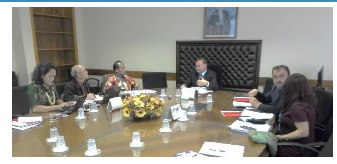
'GATS and Turkish Health Survey' in Turkey April 2016, Beneficiary: BPS-Statistics Indonesia