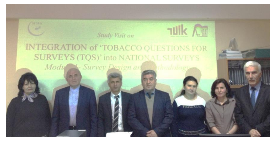
Integration of TQS – Module 2: Survey Design and Methodology' in Azerbaijan April 2015, Provider: TurkStat of Turkey