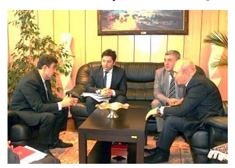
'GATS and Turkish Health Survey' in Turkey November 2014, Beneficiary: SSC of Azerbaijan