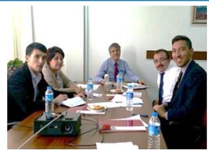
'GATS and Turkish Health Survey' in Turkey

May 2016, Beneficiary: Agency on Statistics under President of the Republic of