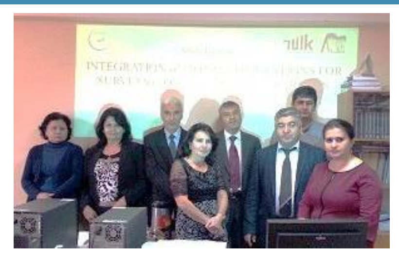
'Integration of TQS – Sampling Methods' in Azerbaijan November 2015, Provider: TurkStat of Turkey