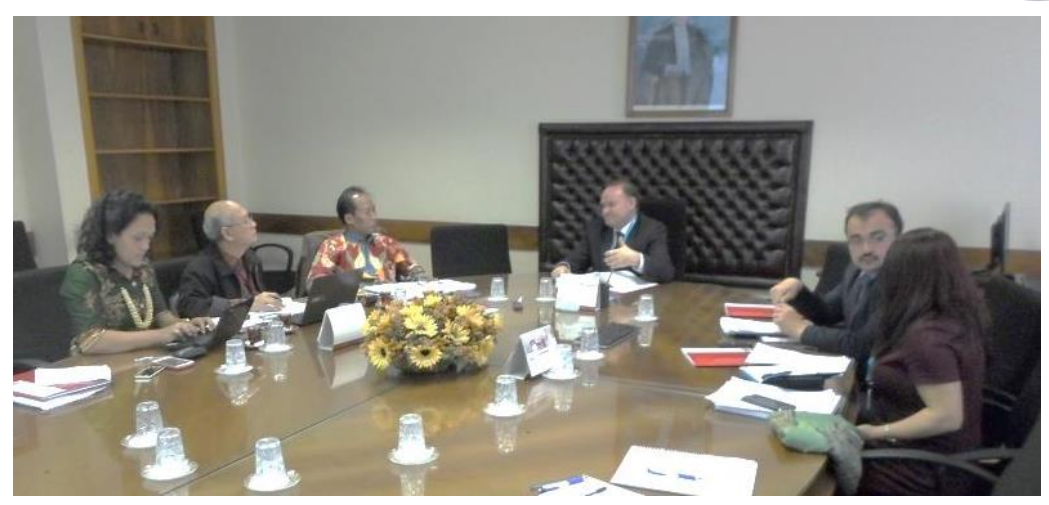
'GATS and Turkish Health Survey' in Turkey April 2016, Beneficiary: BPS-Statistics Indonesia