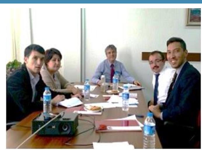
'GATS and Turkish Health Survey' in Turkey

May 2016, Beneficiary: Agency on Statistics under President of the Republic of