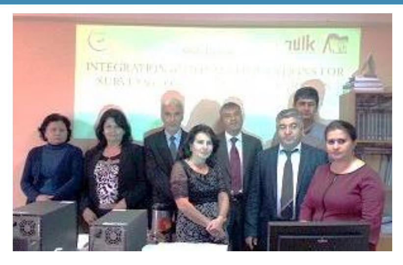
'Integration of TQS – Sampling Methods' in Azerbaijan November 2015, Provider: TurkStat of Turkey