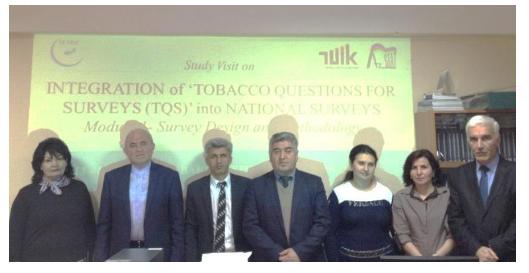
Integration of TQS – Module 2: Survey Design and Methodology' in Azerbaijan April 2015, Provider: TurkStat of Turkey