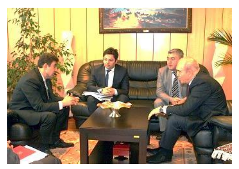
'GATS and Turkish Health Survey' in Turkey November 2014, Beneficiary: SSC of Azerbaijan